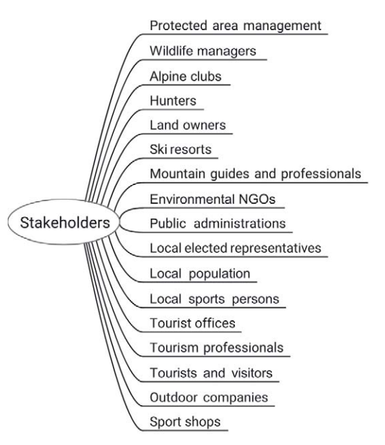
Figure 2 – List of stakeholders for management of winter recreational activities (ALPARC 2016). This list is not exhaustive.

Whereas there are national or regional efforts in Switzerland, the German Alps and Vorarlberg, in many PAs, the initiatives are purely local in scope. All approaches distinguish various target groups.